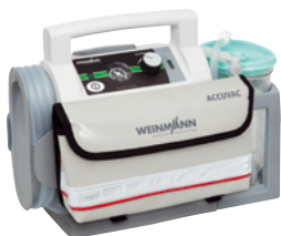
ACCUVAC Lite with disposable canister system with accessories bag, WM 11745