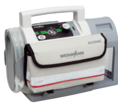
ACCUVAC Lite with reusable canister system* with accessories bag, WM 11740