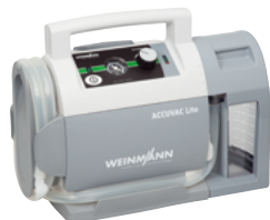
ACCUVAC Lite with reusable canister system* WM 11700