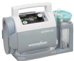
ACCUVAC Lite with disposable canister system, WM 11705

Select your preferred ACCUVAC Lite combination: