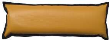
NIEJ Yellow Lumbar Support (1)