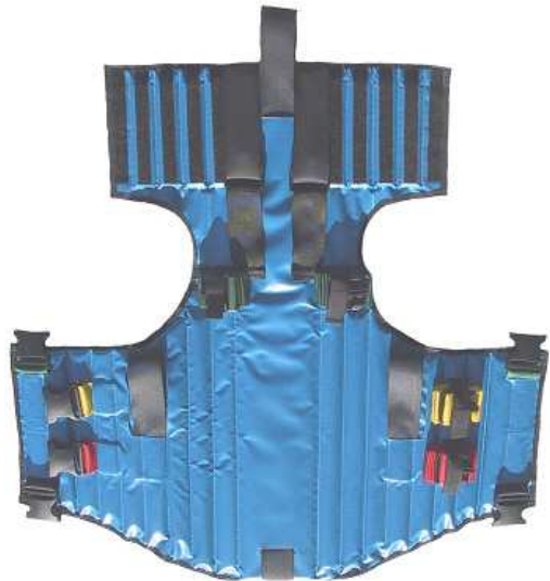
NIEJ Jacket (1)