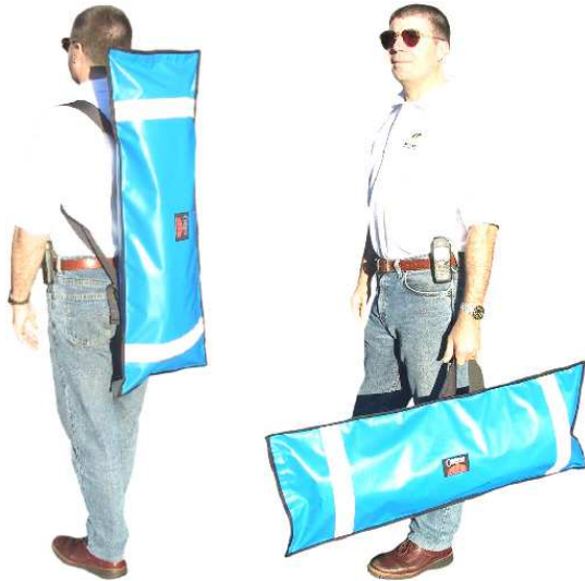
NIEJ Carry Bag (1)