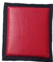
NIEJ Red Head Pad (4)