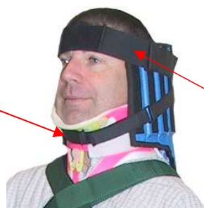
NIEJ Forehead Strap 50 mm (1)