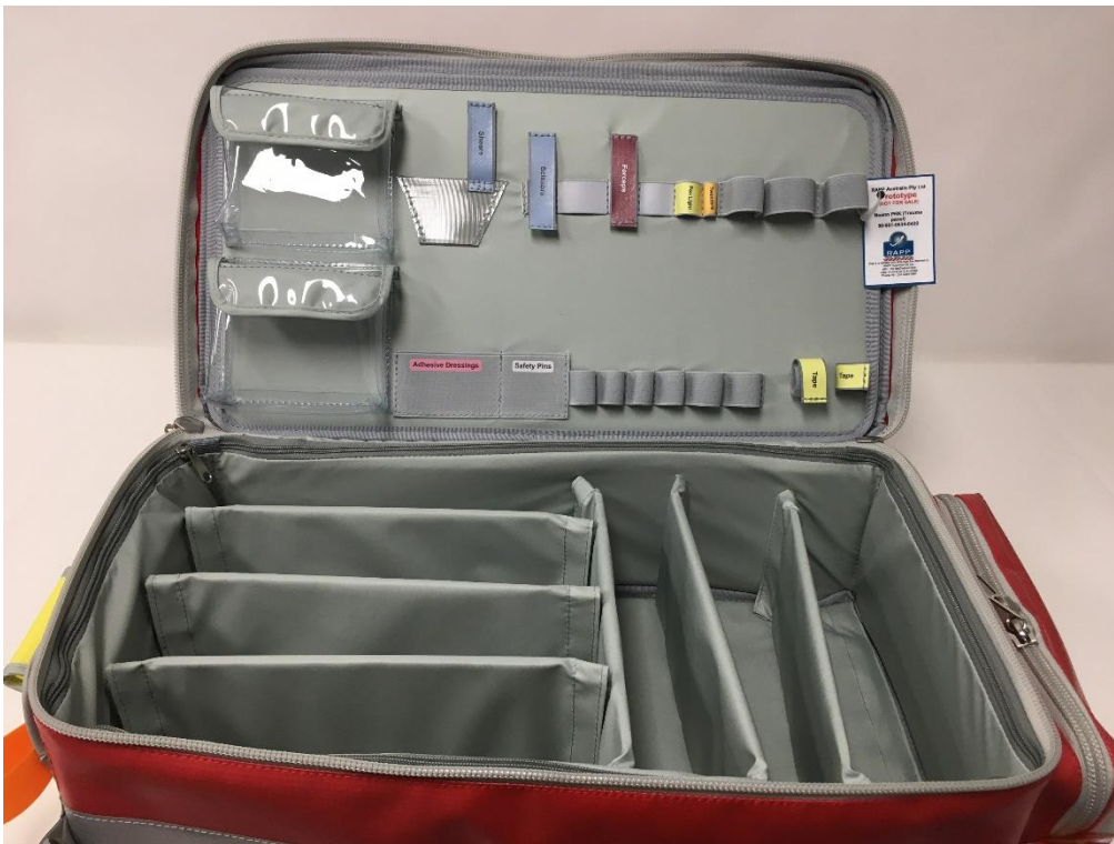
Shown in NEANN PRK 50-001-0630-0192 (Separate Product)

Head Office RAPP Australia Pty. Ltd. 160 McClelland Ave, PO Box 120, Lara, Victoria, 3212, Australia ABN 35 054 189 365