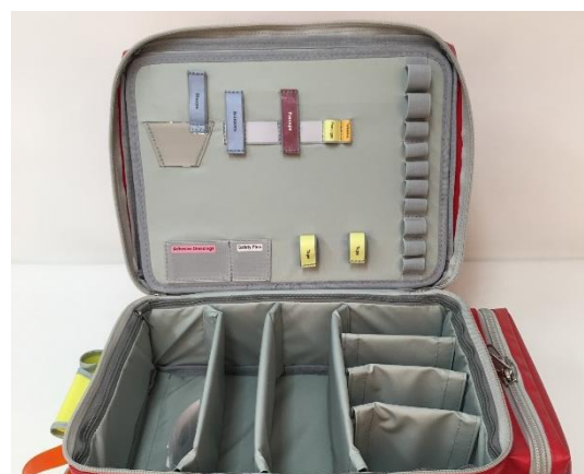
Shown in NEANN TEK+ 50-001-0631-0192 (Separate Product)