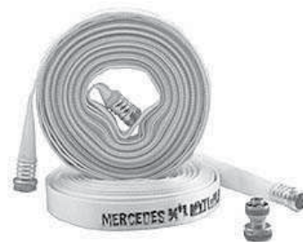
19mm Lay Flat MYTFLO hose